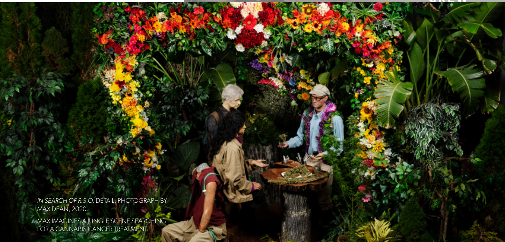
IN SEARCH OF R.S.O. DETAIL, PHOTOGRAPH BY MAX DEAN, 2020.

MAX IMAGINES A JUNGLE SCENE SEARCHING FOR A CANNABIS CANCER TREATMENT.