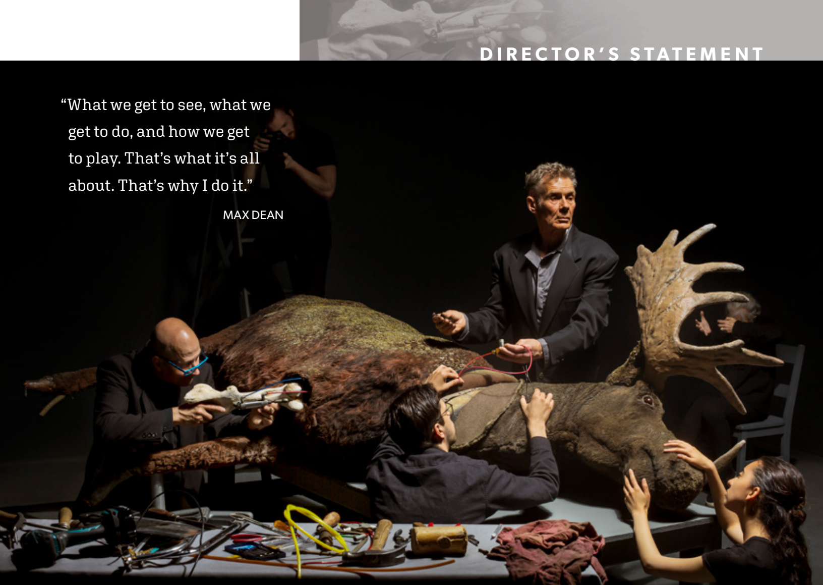
ABOVE: THE GROSS CLINIC.